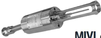
MIVI process viscometer