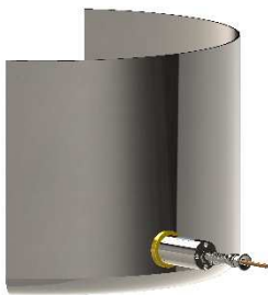
On reactor wall