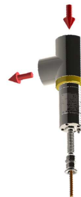
On a bypass loop

Any questions or specific needs regarding other viscosity solutions? Let us help you find the best match for your process by contacting us at: instruments@sofraser.com